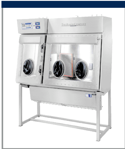
The IsoGARD® glovebox, Model IG-12.

Additionally, IsoGARD® ergonomic features make for a glovebox that is much more comfortable to work in than those of the past. These include oval gloveports mounted directly into the 10° tilted viewing window, exhaust plenums located away from a sitting operator's knees and external light canopies positioned above the user's head.