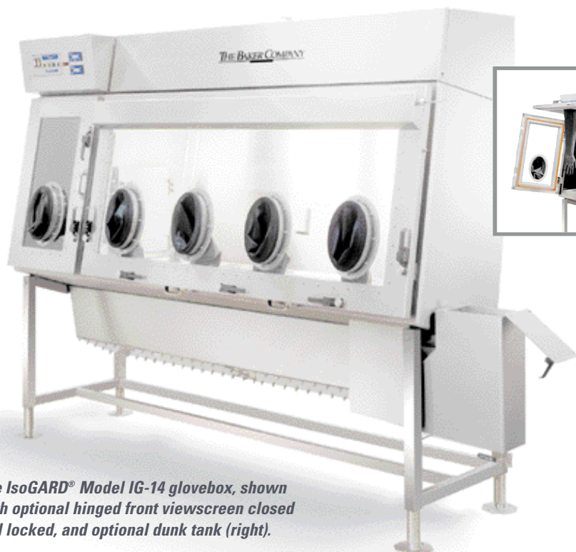
The IsoGARD® Model IG-14 glovebox, shown with optional hinged front viewscreen closed and locked, and optional dunk tank (right).